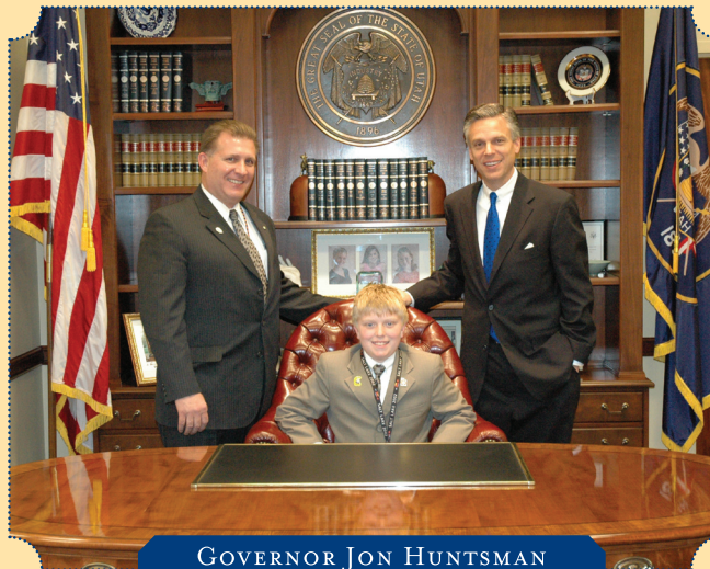
GOVERNOR JON HUNSTMAN WITH CURT AND ZAC BRAMBLE